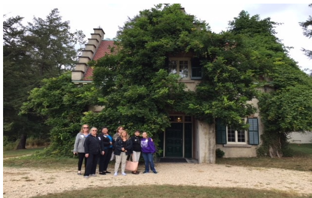
Members of Castle Manor GC at the home of Washington Irving in Sleepy Hollow, NY