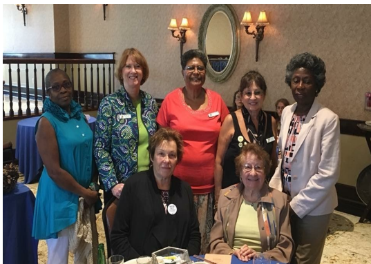
Members of Castle Manor GC Oct, 19th 1st District luncheon at the Staaten.