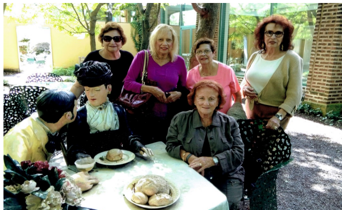
Great Kills GC members at Grounds for Sculpture in New Jersey.