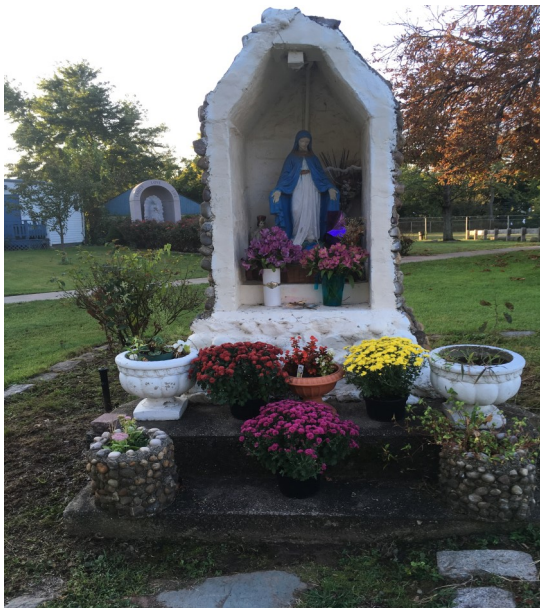
Poinsettia plants placed at the Blessed Mother Grotto at Saint Joseph's Church.