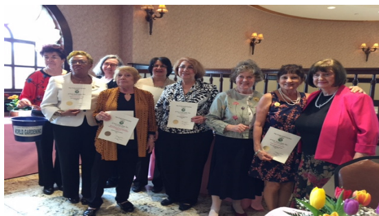
State Citations awarded to Club Presidents at District Luncheon.