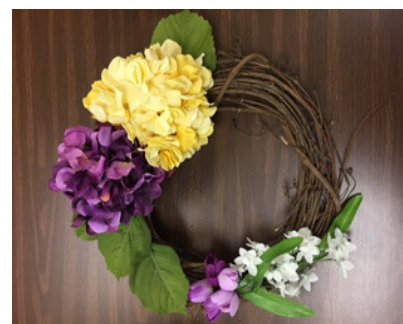
Members of Richmond Evergreen GC made wreaths for graduates of Amethyst as part of a Garden Therapy Project