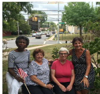
Castle Manor GC members in 9/11 Garden at All Saints Episcopal Church.