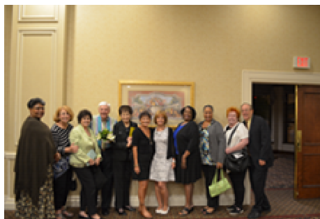
District One members at Fall Conference in Utica NY.