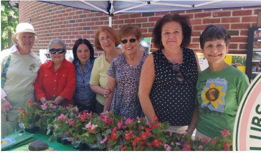
District members at Conservation Celebration at the Staten Island Zoo.