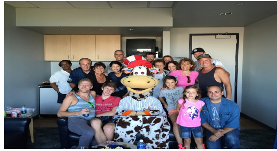
. Castle Manor GC members with family and Scooter at Staten Island Yankees game.