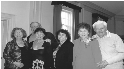
District One contingent at FGCNYS State Meeting in Albany—March 2015