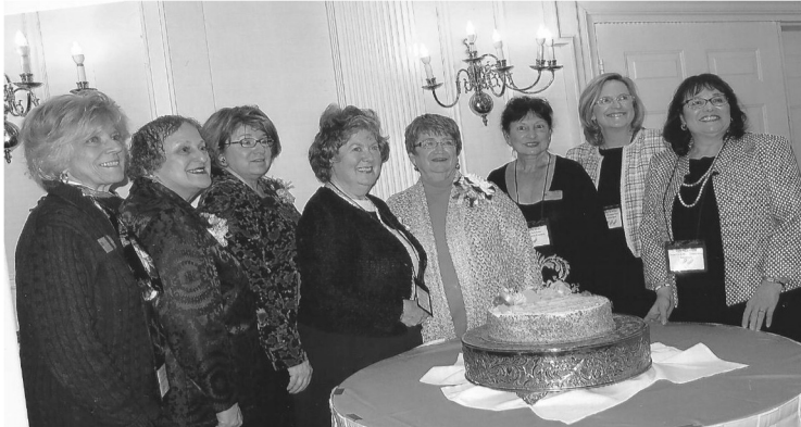
The New FGCNYS State Board for 2015 to 2017