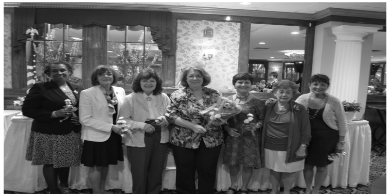
Incoming District One Board for 2015- 2017.